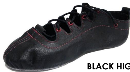
BLACK HIGHLAND PUMP