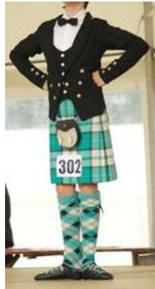
MALE DANCER WEARING PRINCE CHARLES JACKET