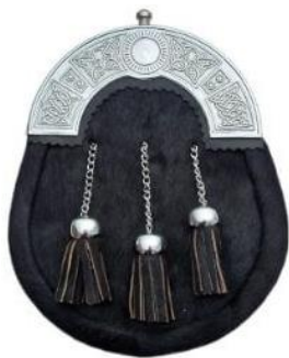
SPORRAN WITH PLATED TOP