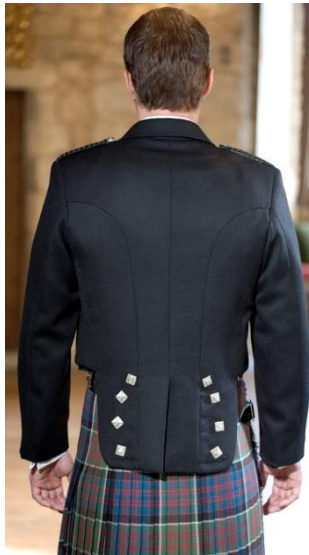
PRINCE CHARLES JACKET FRONT AND REAR VIEWS