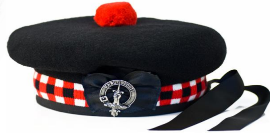
BALMORAL WITH CREST