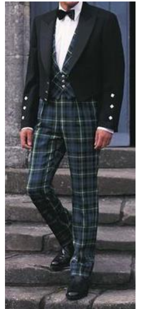
TROWS AS MAY BE WORD FOR THE SEANN TRIUBHAS