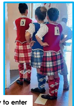
3 Pre-Graders ready to enter