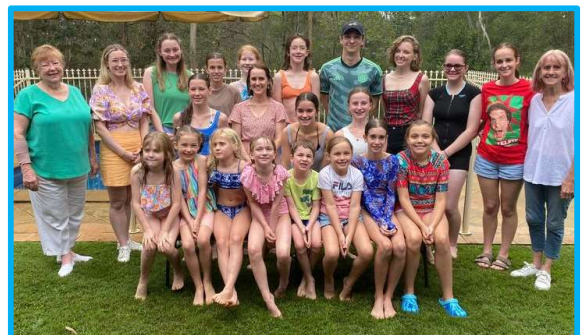
Thistle HD Studio Christmas Breakup Party